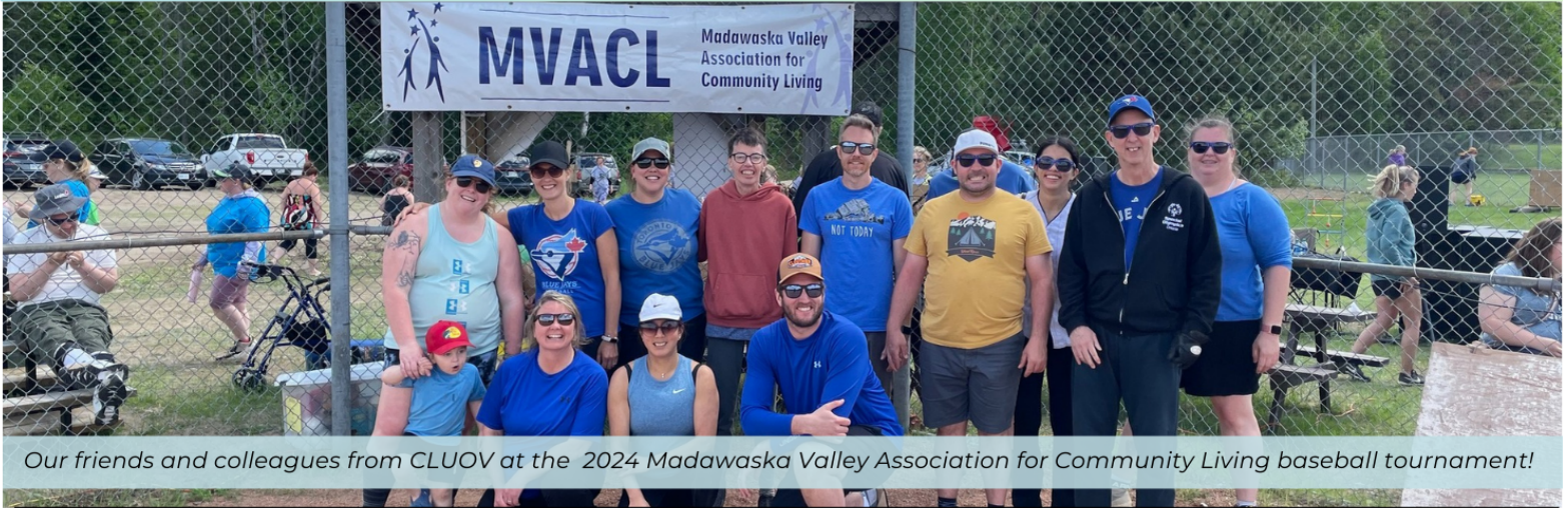
Our friends and colleagues from CLUOV at the 2024 Madawaska Valley Association for Community Living baseball tournament!

894 PEMBROKE ST WEST | WWW.CLUOV.CA | (613) 735 - 0659