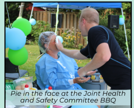
Pie in the face at the Joint Health and Safety Committee BBQ