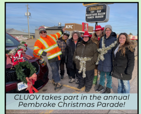
CLUOV takes part in the annual Pembroke Christmas Parade!

the practice or policy of providing equal access to opportunities and resources for people who might otherwise be excluded or marginalized