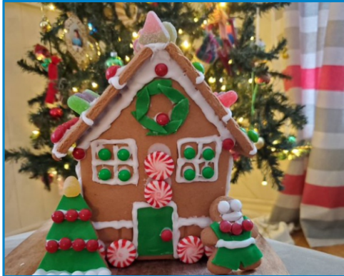
Gingerbread house decorating as part of CLUOV's social committee activities.

The golf tournament is dedicated to the Outcomes Fund which allow us to support people with financial assistance, purchases and goals.