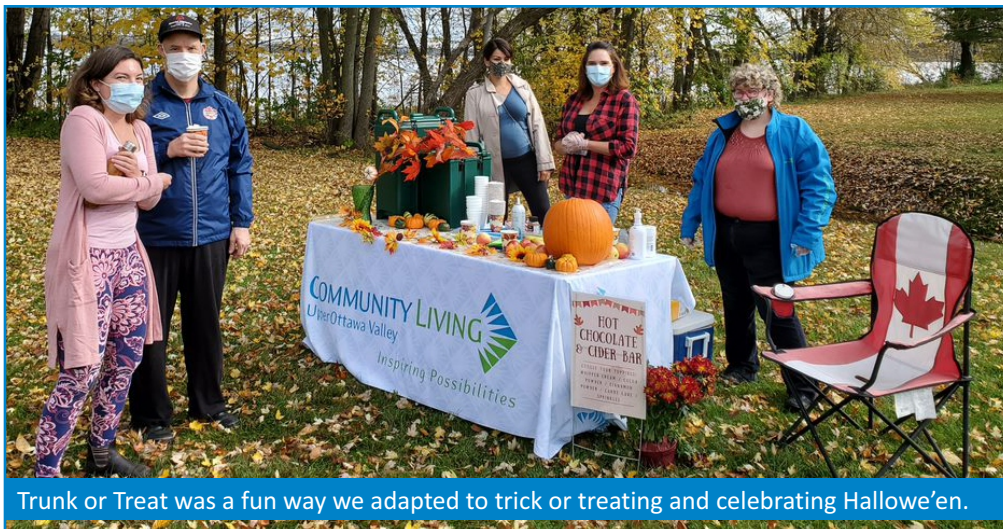
Trunk or Treat was a fun way we adapted to trick or treating and celebrating Hallowe'en.