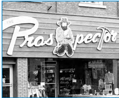
The Facebook stories took readers on a 60-year journey in 31 days.