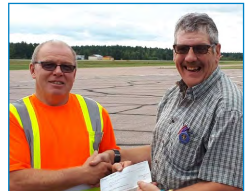
CLUOV purchased a foot of runway for the airport's repaving campaign.