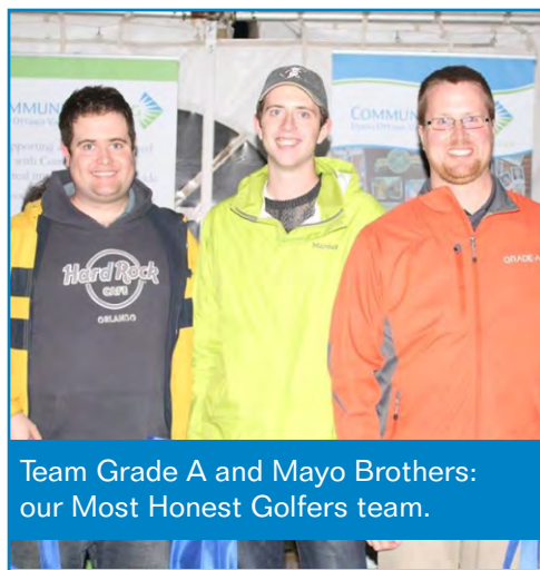
Team Grade A and Mayo Brothers: our Most Honest Golfers team.

Bee Successful also extends a huge "thanks" to our four students who worked very diligently to ensure the success of the people who were looking for work opportunities. This was a successful launch of the program that we anticipate will help many people find employment.