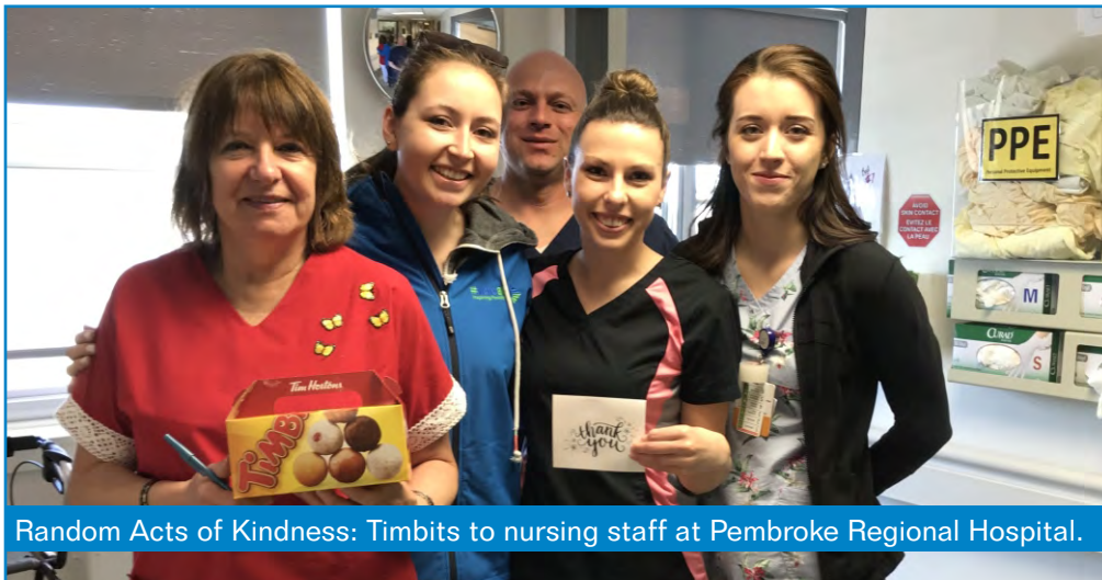
Random Acts of Kindness: Timbits to nursing staff at Pembroke Regional Hospital.

We send a huge "congratulations" to all CLUOV staff, board members and people supported for helping us achieve this incredible work. As a note, other Community Living organizations have been inspired by the random acts and hope to initiate the action as part of their own upcoming milestone celebrations.