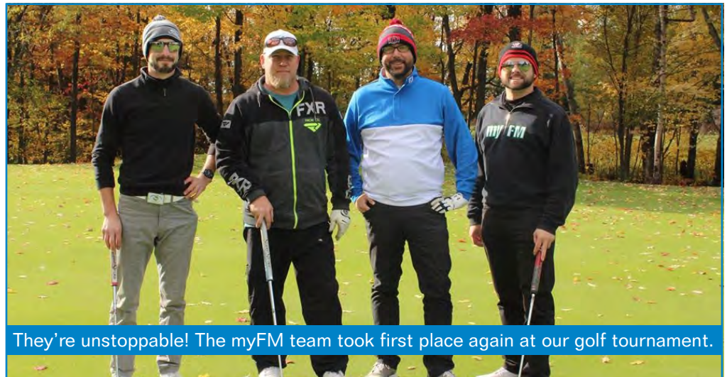
They're unstoppable! The myFM team took first place again at our golf tournament.