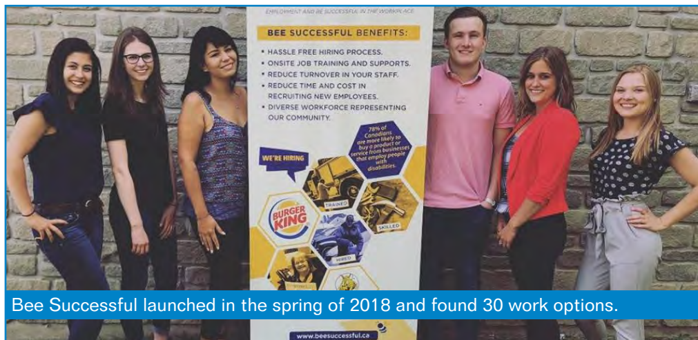
Bee Successful launched in the spring of 2018 and found 30 work options.

It has been a first summer to remember for Bee Successful, a newly launched employment resource for people with disabilities.